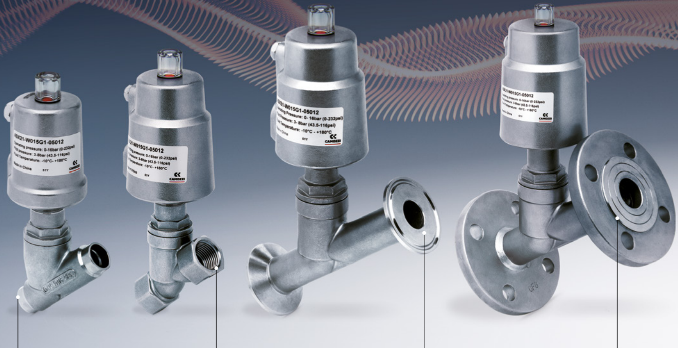
VERSION WITH WELDING ENDS DIN 11850-2 AND DIN 11850-3